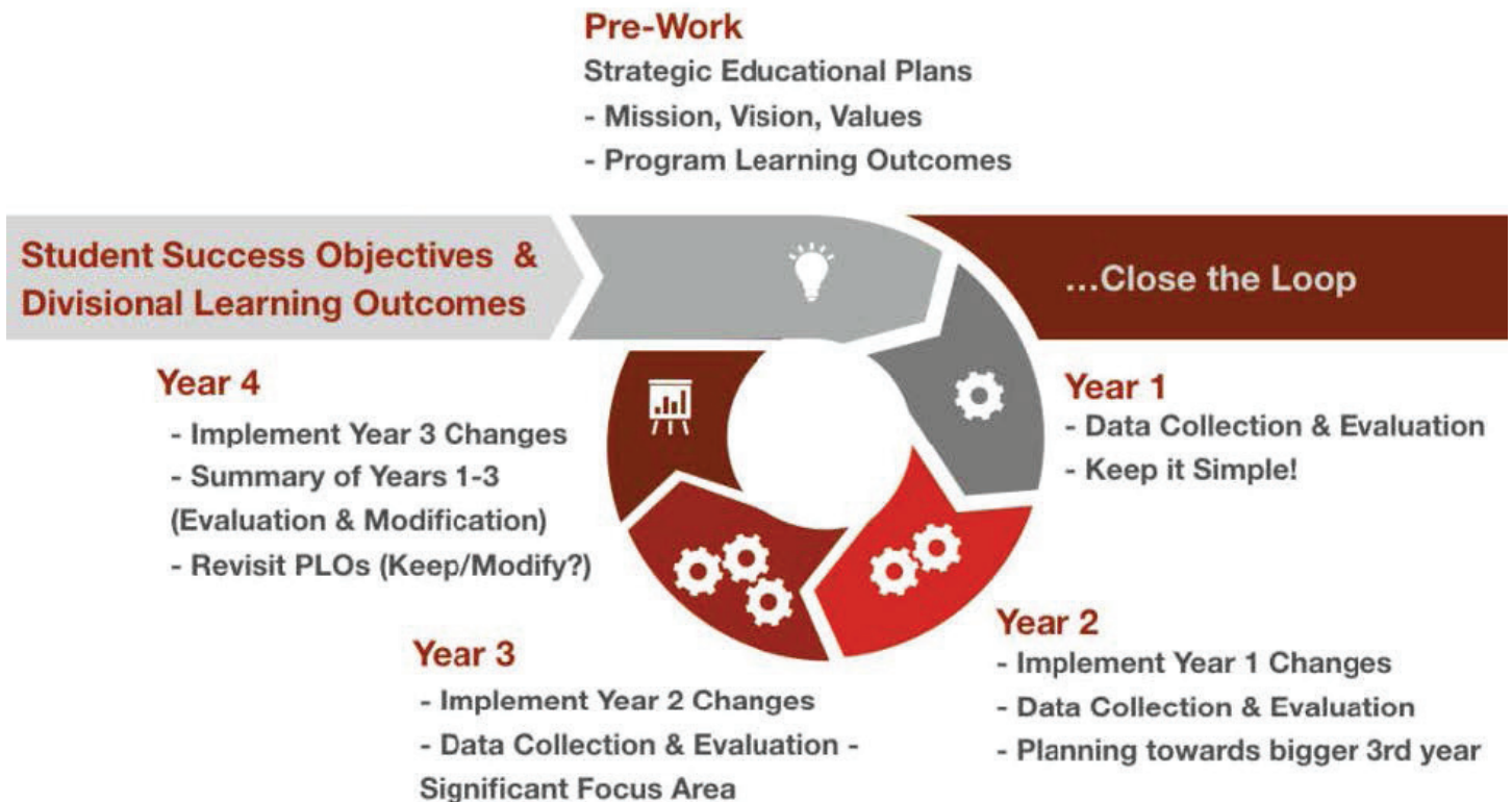
Figure 2: Student Development Assessment Cycle

This mapping process yielded some important discussion and distinctions. For example, if departments are not connected with the overarching outcomes of Student Affairs, then perhaps they should be moved to another division or they may need to consider adjusting their alignment. These conversations proved to be invaluable as we had initially failed to differentiate between programs and services. These areas still maintain departmental goals, but to force the development of learning outcome alignment for the sake of alignment is just plain futile... again, square peg meets round hole.