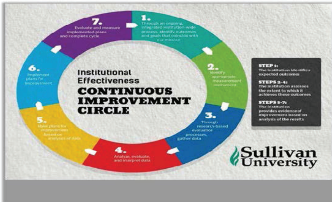
Figure 3: Institutional Effectiveness Continuous Improvement Circle