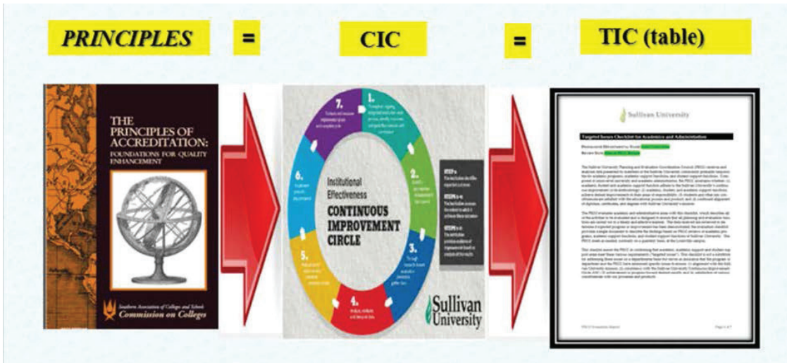
Figure 1: Culture of Continuous Improvement Operationalization.

“PECCconomics” refers to management of the university’s PECC’s (Planning and Evaluation Coordinating Council) IE process, protocols and its associated body of knowledge.