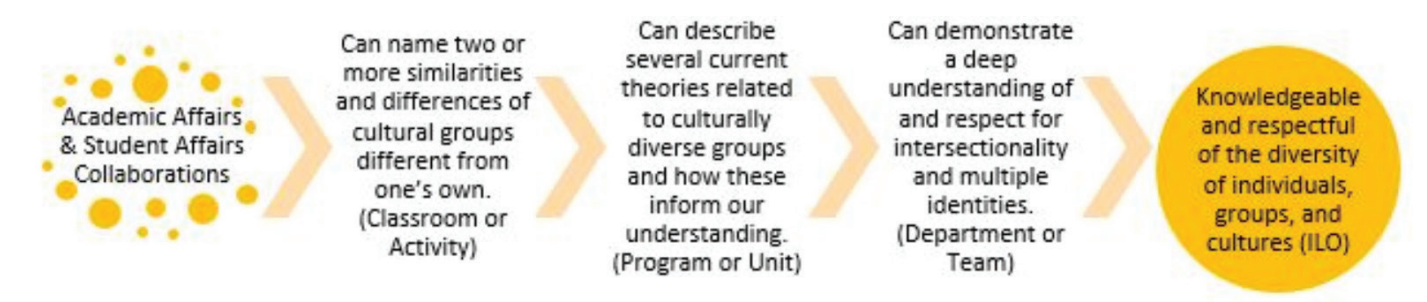
Figure 3: Academic Affairs and Student Affairs Collaborative Learning Outcomes for Diversity Awareness