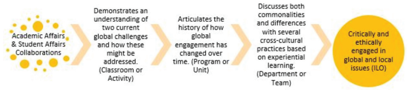
Figure 2. Academic Affairs and Student Affairs Collaborative Learning Outcomes for Global Engagement

Scaffolded Learning Outcomes for Global Engagement