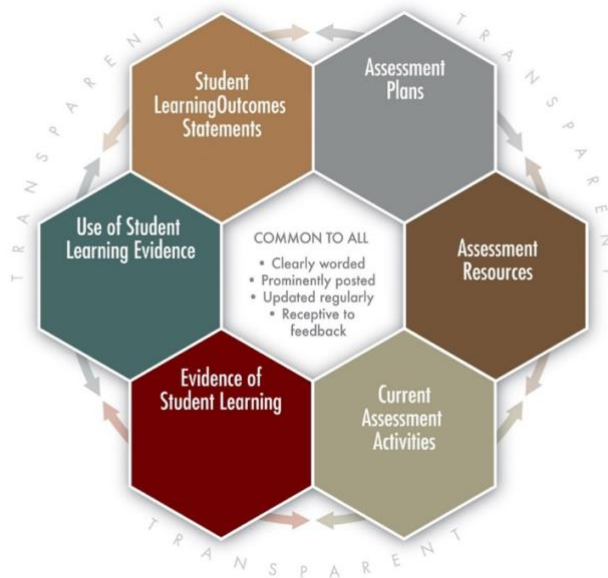
Figure 2: The National Institute for Learning Outcomes Assessment (NILOA) Transparency Framework

The National Institute for Learning Outcomes Assessment (NILOA) created the Transparency Framework “to help institutions evaluate the extent to which they are making evidence of student accomplishment readily accessible and potentially useful and meaningful to various audiences.” 7 Based on a national review of institutional assessment websites, the Transparency Framework consists of six components centered around a set of common underlying principles (see Figure 2).