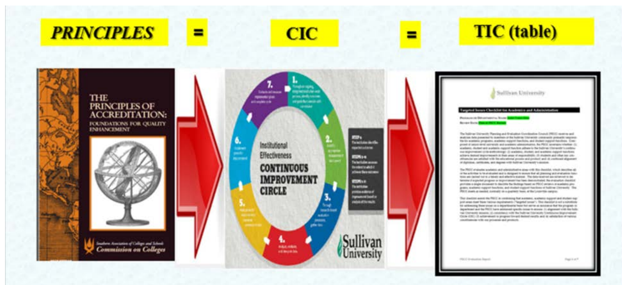
Figure 1: Culture of Continuous Improvement Operationalization.

Revised for the 2016 assessment cycle, the most recent PECEconomic process flow (see Figure 4, below) comprises the following essential steps, which emphasize Fulcher-ian improvement/accountability over the subtextual process. During each departmental presentation, the PECC examines these seven Targeted Issues Checklist -ed macro - and microPECEconomic assessment areas