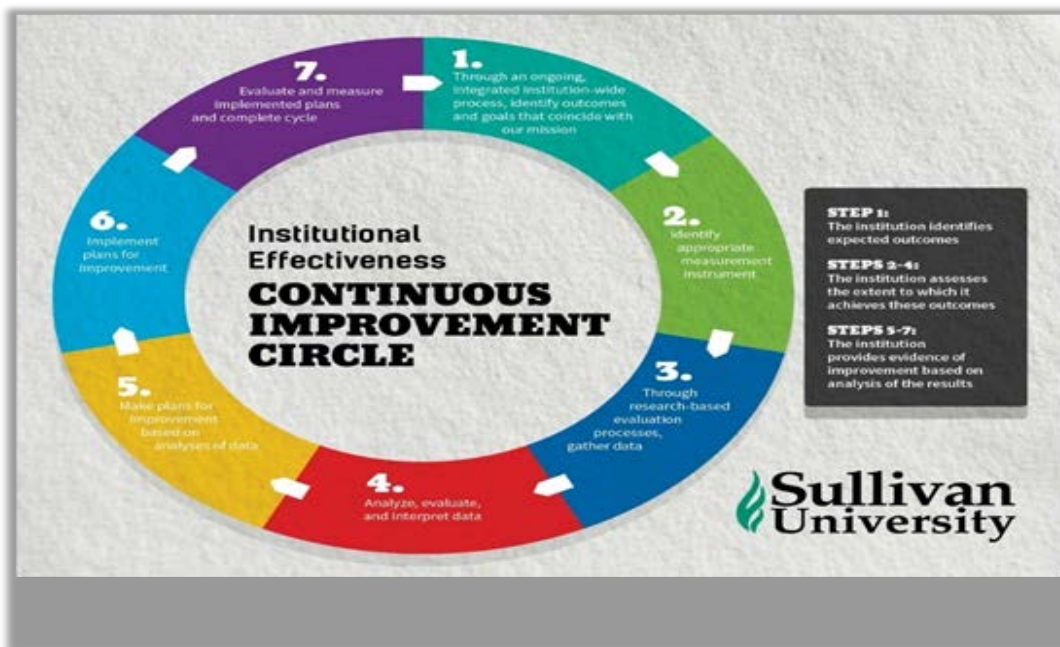
Figure 3: Institutional Effectiveness Continuous Improvement Circle

Fundamentally, as might be expected, the PECC’s primary IE focus centers on the macroPECConomic assessment area of “Culture of Continuous Improvement,” (CoCI) whereby individual educational program or support units apply the seven-step Sullivan University Continuous Improvement Circle (CIC) [see Figure 3] to assess and to analyze their expected outcomes. The university’s CoCI embraces a culture of both assessment and of informed action in which department-determinant and -specific outcomes are assessed so that the resultant data may be used to drive actionable plans for improvement. As a result, IE principles of accreditation are operationalized via the university’s seven-step Continuous Improvement Circle .